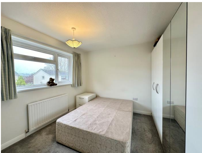
BEDROOM THREE - 2.9m x 2.69m (9'6" x 8'10") Textured ceiling with pendant light point, uPVC double glazed window to front aspect with sea views towards Torquay, radiator with thermostat control.