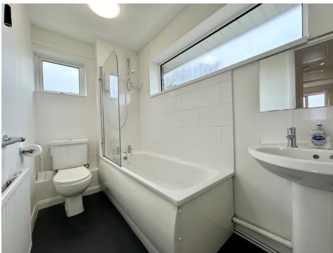
SHOWER ROOM - 1.96m x 0.76m (6'5" x 2'6") Textured ceiling with light point, obscure glazed window, radiator with thermostat control. Comprising tiled shower enclosure with bifold door and electric shower.