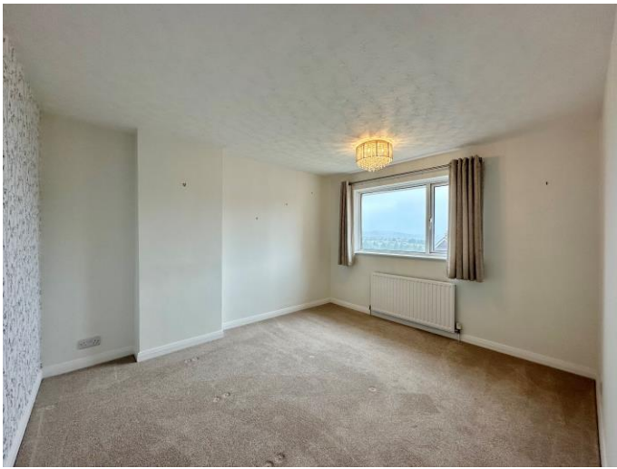
BEDROOM TWO - 3.25m x 3.12m (10'8" x 10'3") Textured ceiling with pendant light point, uPVC double glazed window to rear aspect, radiator with thermostat control, fitted wardrobes to one wall.